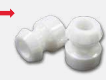
Lifetime: 7 weeks