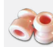
Lifetime: 2 weeks