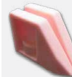
Lifetime: 1-2 months