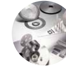
Zirconia (ZrO 2 )