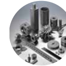
Silicon Nitride (Si 3 N 4 )