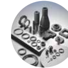
Silicon Carbide (SiC)