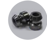
Others (Titania, Cermet, Sapphire etc.)