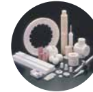
Alumina (Al 2 O 3 )